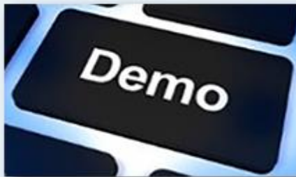
ACORD2016: DEMOS IN THE SPOTLIGHT