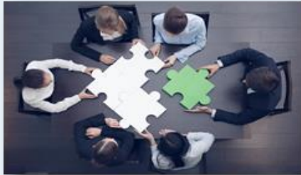
LIFE & ANNUITY WORKING GROUP UPDATES