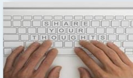
TAKE THE ACORD AND GARTNER SURVEY