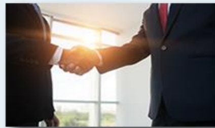
ACORD JOINS T&M PROGRAM AT UNIVERSITY OF ILLINOIS