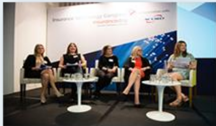
INSURANCE TECHNOLOGY CONGRESS 2016