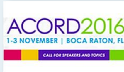
LIFE & ANNUITY AT ACORD2016