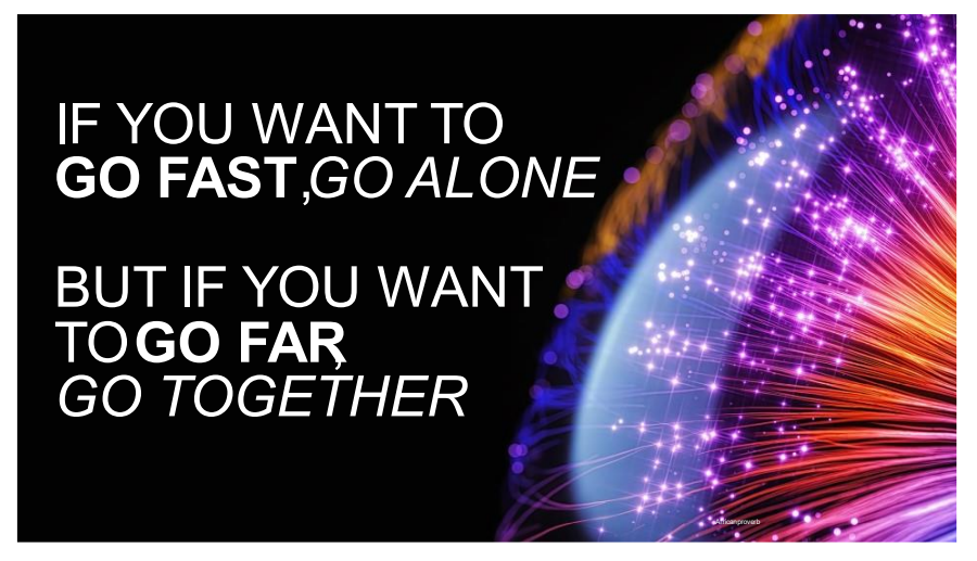
Quote of an African Proverb

Whilst individual industry partners are at different steps in their digital journey, everyone agreed on the slogan at the Ruschlikon 15<sup>th</sup> Year Anniversary Celebrations.